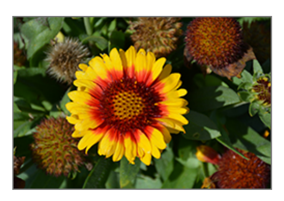
Mesa Bright Bicolor Blanket Flower flowers