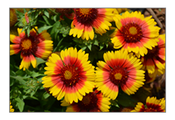
Mesa Bright Bicolor Blanket Flower flowers

Mesa Bright Bicolor Blanket Flower is a dense herbaceous perennial with a mounded form. Its relatively fine texture sets it apart from other garden plants with less refined foliage.