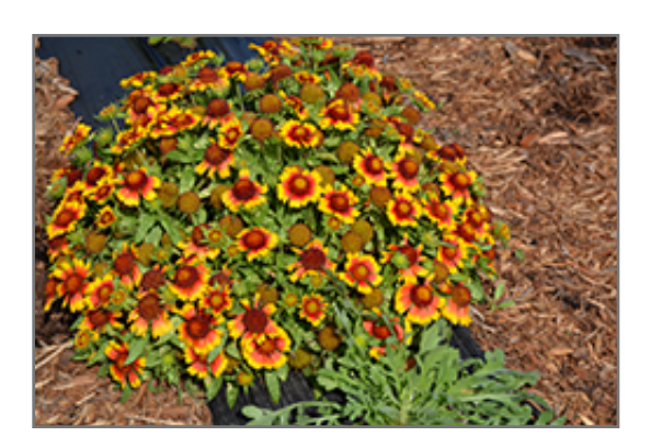
Mesa Bright Bicolor Blanket Flower in bloom