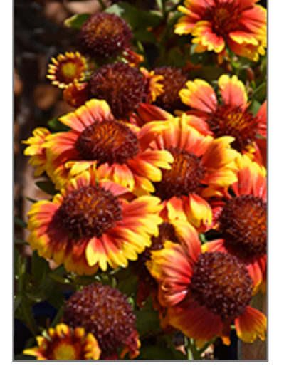
Gallo Fire Blanket Flower flowers

This stunning variety has stunning coral-red daisy-like flowers with yellow tips and golden centers; prefers moist, rich sites but will adapt to dry sites; deadhead to promote re-blooming; good for naturalizing