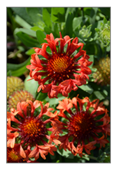
Fanfare Blaze Blanket Flower flowers

This stunning variety has stunning orange-red daisy-like flowers with recurved petals and darker red centers; prefers moist, rich sites but will adapt to dry sites; deadhead to promote re-blooming; good for naturalizing