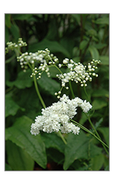
Plena Double Dropwort flowers

Plena Double Dropwort features delicate panicles of white flowers at the ends of the stems from late spring to mid summer. The flowers are excellent for cutting. Its ferny compound leaves remain dark green in colour throughout the season.