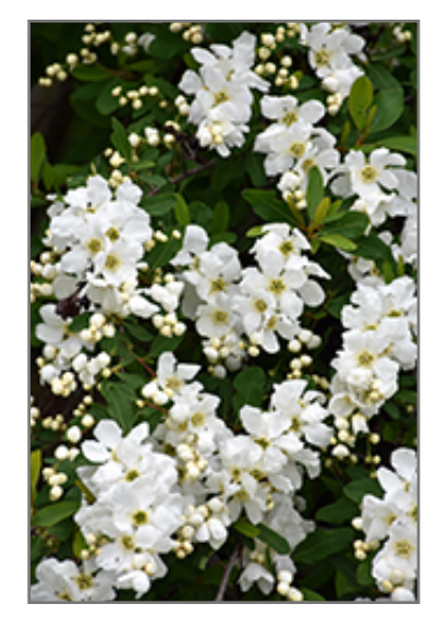
Snow Day Surprise Pearlbush flowers

Snow Day Surprise Pearlbush is recommended for the following landscape applications;