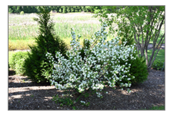
Snow Day Surprise Pearlbush in bloom