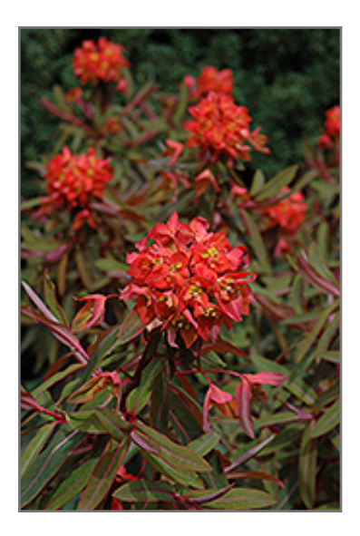
Dixter Spurge flowers

Dixter Spurge is recommended for the following landscape applications;