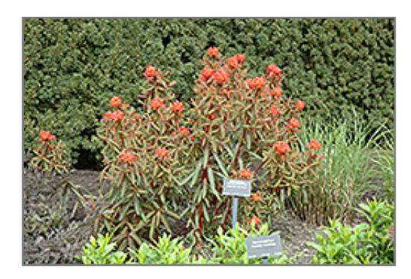
Dixter Spurge in bloom