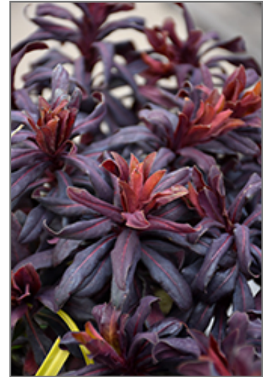
Ruby Glow Wood Spurge flowers

This is a relatively low maintenance plant, and should only be pruned after flowering to avoid removing any of the current season's flowers. Deer don't particularly care for this plant and will usually leave it alone in favor of tastier treats. It has no significant negative characteristics.