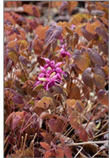
Yubae Bishop's Hat flowers