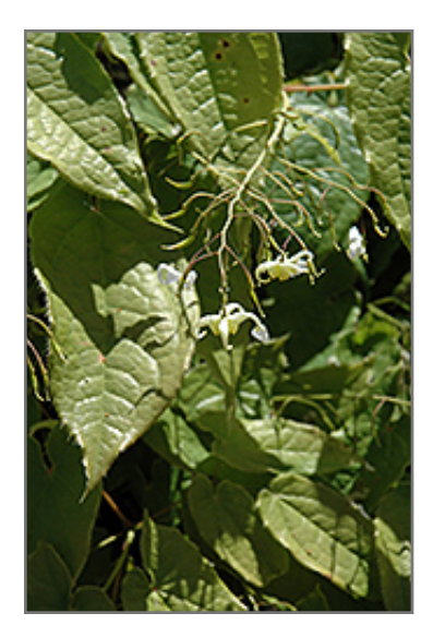
Brimstone Butterfly Bishop's Hat flowers

Brimstone Butterfly Bishop's Hat is recommended for the following landscape applications;