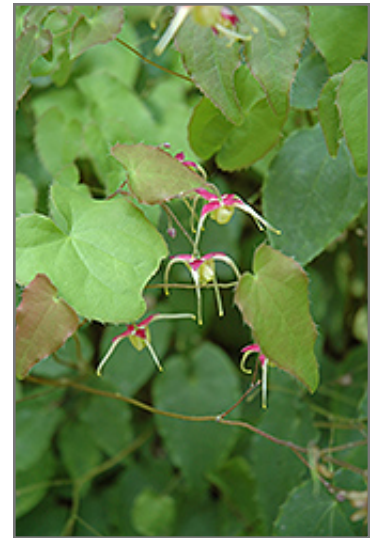
Yokihi Bishop's Hat flowers

Yokihi Bishop's Hat is recommended for the following landscape applications;