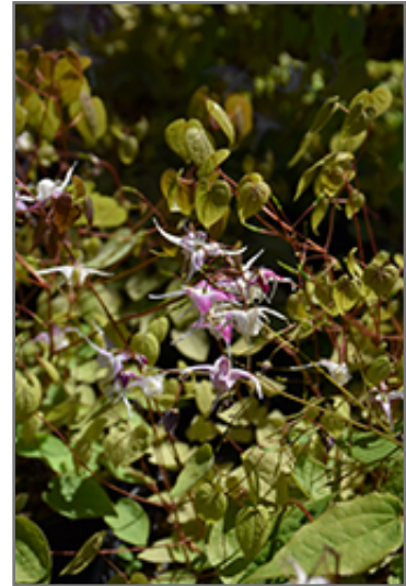
Tama No Genpei Bishop's Hat flowers