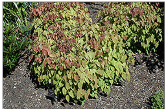
Tama No Genpei Bishop's Hat in bloom