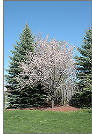
Newport Plum in bloom

This tree should only be grown in full sunlight. It does best in average to evenly moist conditions, but will not tolerate standing water. It is not particular as to soil type or pH. It is highly tolerant of urban pollution and will even thrive in inner city environments. This is a selected variety of a species not originally from North America.