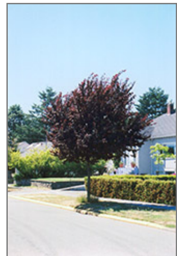
Newport Plum