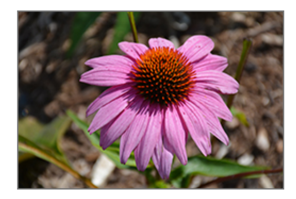
Prairie Splendor Coneflower flowers