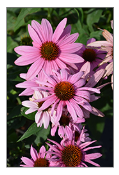
Prairie Splendor Coneflower flowers

This is a relatively low maintenance plant, and is best cleaned up in early spring before it resumes active growth for the season. It is a good choice for attracting birds and butterflies to your yard, but is not particularly attractive to deer who tend to leave it alone in favor of tastier treats. It has no significant negative characteristics.