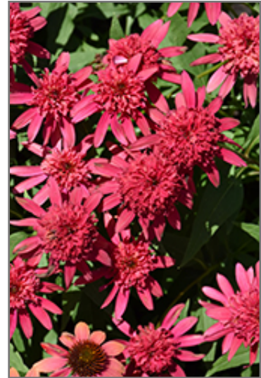
Double Scoop Raspberry Coneflower flowers

Double Scoop Raspberry Coneflower is recommended for the following landscape applications;