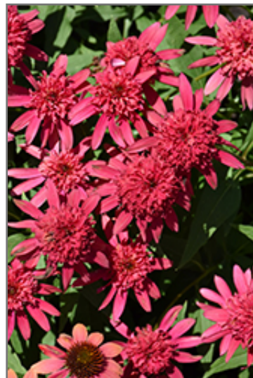
Double Scoop Raspberry Coneflower flowers

Double Scoop Raspberry Coneflower is recommended for the following landscape applications;