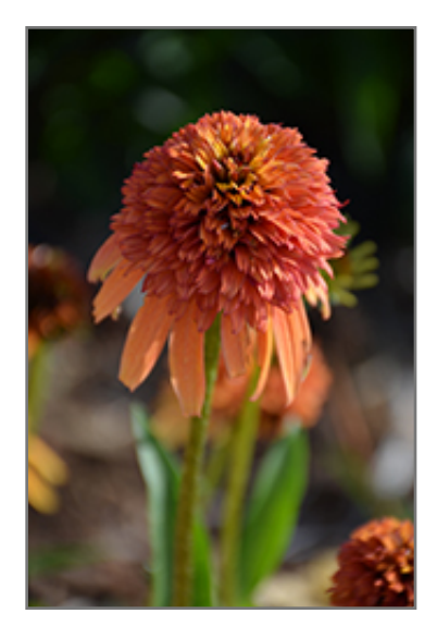
Cone-fections Marmalade Coneflower flowers

Cone-fections Marmalade Coneflower is recommended for the following landscape applications;