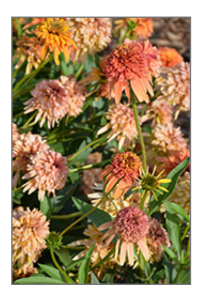
Cone-fections Marmalade Coneflower flowers