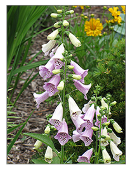
Foxy Foxglove flowers

Features elegant white, lilac and rose colored flowers with burgundy spots; tall spikes rise above attractive green lance-shaped leaves; a biennial that's happiest in part shade with adequate moisture