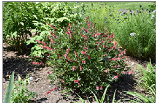
Valentine Bleeding Heart in bloom