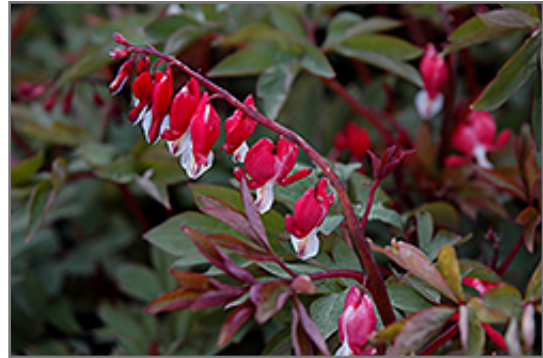
Valentine Bleeding Heart flowers

Valentine Bleeding Heart is recommended for the following landscape applications;