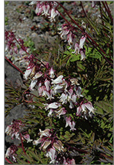
White Wild Bleeding Heart flowers