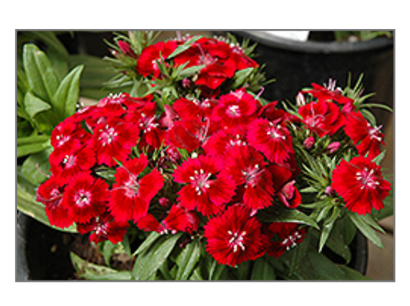
Barbarini Sweet William flowers

Deliciously clove-scented, velvety frilly blood-red flowers with even darker red rings; optimal site has full sun with ample moisture; amend clay soils for best growth; seeds freely but divide for truest color