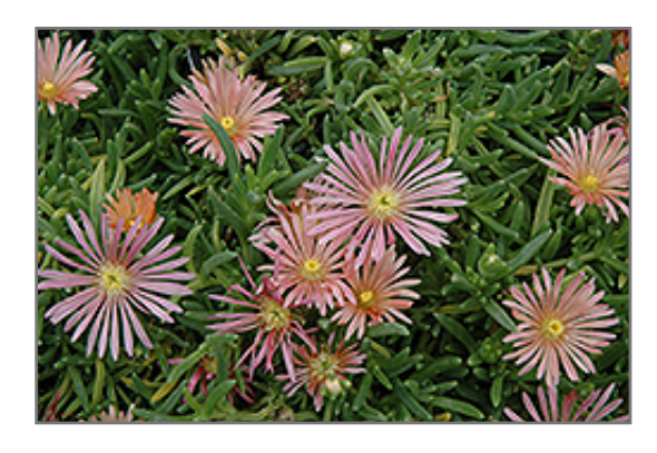
Mesa Verde Ice Plant flowers