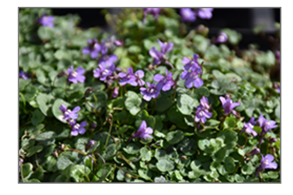
Mini Kenilworth Ivy flowers