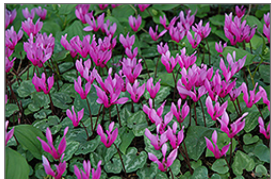
Purple Cyclamen in bloom