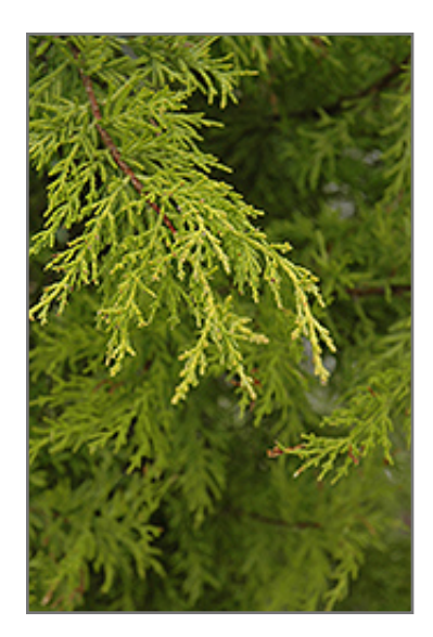
Yellow MacNab Cypress foliage