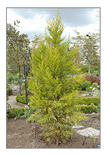
Yellow MacNab Cypress