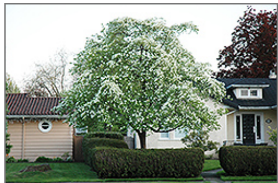
Pacific Dogwood in bloom