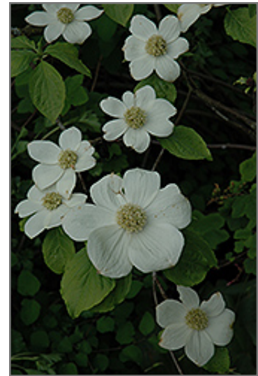
Pacific Dogwood flowers