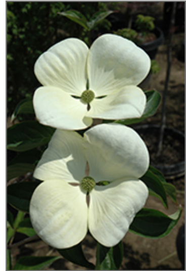
Venus Flowering Dogwood flowers