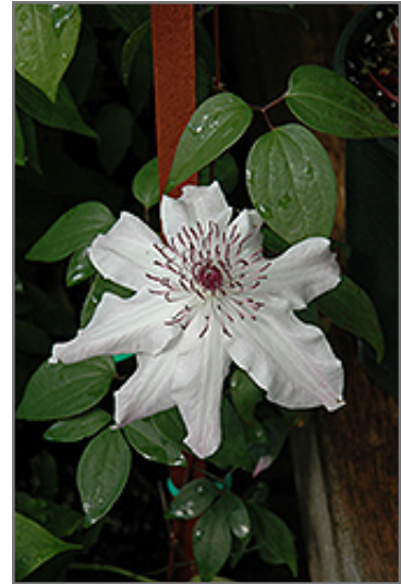
Eye Of The Storm Clematis flowers