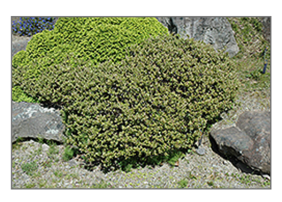
Compact Leatherleaf

This low growing compact native has a lovely fine texture with its small, dark green leathery leaves that bronze in the winter; dainty white bell flowers along the stems in spring; a great plant for the water's edge