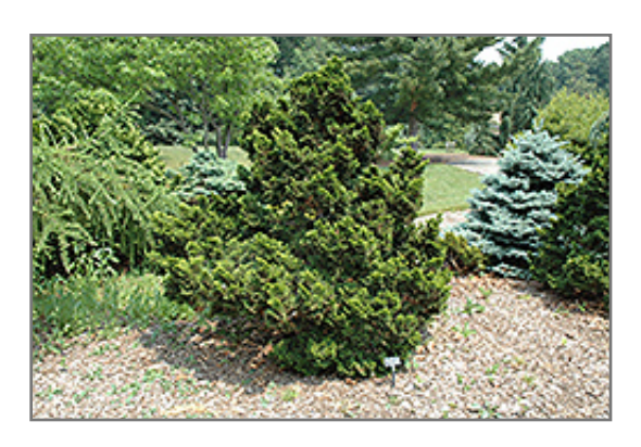
Nana Compacta Hinoki Falsecypress

A graceful addition to any home landscape, this small accent tree features very finely-textured green foliage all season long on a conical form; best used for articulation or as an accent in the yard