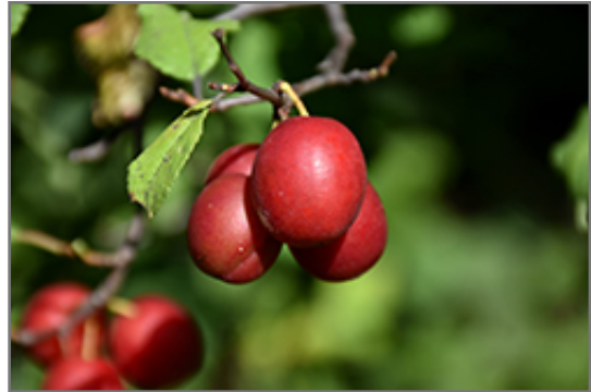
Toka Plum fruit