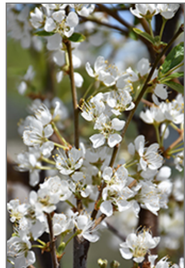
Toka Plum flowers