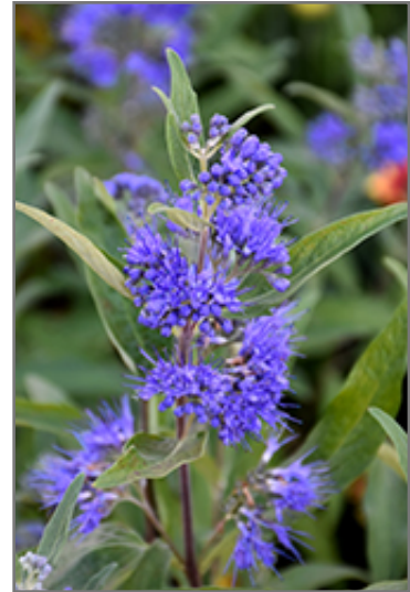
Sapphire Surf Caryopteris flowers

Sapphire Surf Caryopteris is recommended for the following landscape applications;