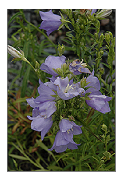
Telham Beauty Peachleaf Bellflower flowers