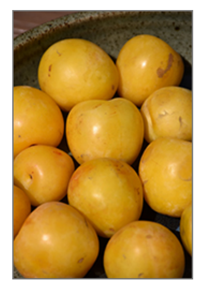
Shiro Plum fruit

Shiro Plum is blanketed in stunning clusters of fragrant white flowers along the branches in early spring before the leaves. It has forest green deciduous foliage. The pointy leaves turn yellow in fall. The fruits are showy yellow drupes with a pink blush, which are carried in abundance in mid summer. The fruit can be messy if allowed to drop on the lawn or walkways, and may require occasional clean-up.