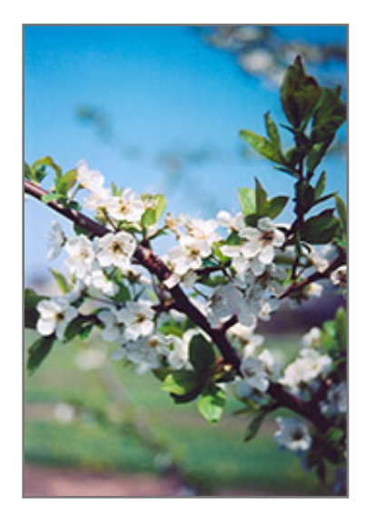
Shiro Plum flowers