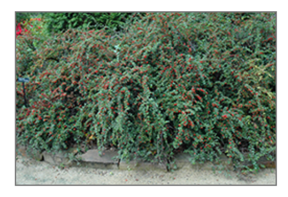
Cranberry Cotoneaster