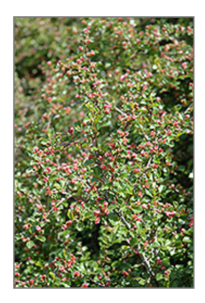
Cranberry Cotoneaster flowers

This shrub does best in full sun to partial shade. It is very adaptable to both dry and moist growing conditions, but will not tolerate any standing water. It is not particular as to soil type or pH, and is able to handle environmental salt. It is highly tolerant of urban pollution and will even thrive in inner city environments. This species is not originally from North America.