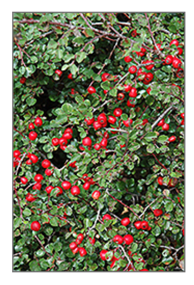
Cranberry Cotoneaster fruit

Cranberry Cotoneaster is recommended for the following landscape applications;