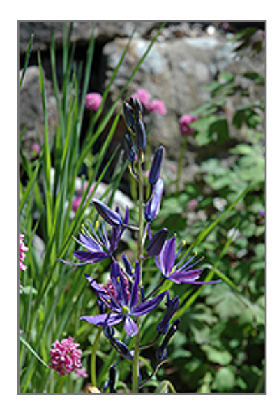
Suksdorf's Camassia flowers

Elegant, large blue star-flowers steal the show in springtime; underplant with lower growers as leaves will die back; good plant for wet edges of ponds and bogs; plant bulbs in fall; a strong plant that seldom needs support