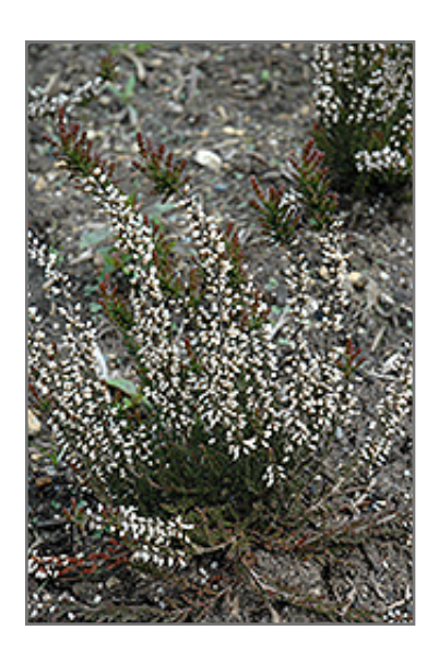
Suzanne Heather flowers