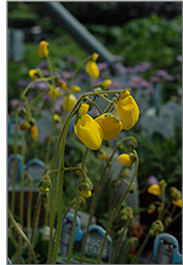
Goldcap Pocketbook Flower flowers