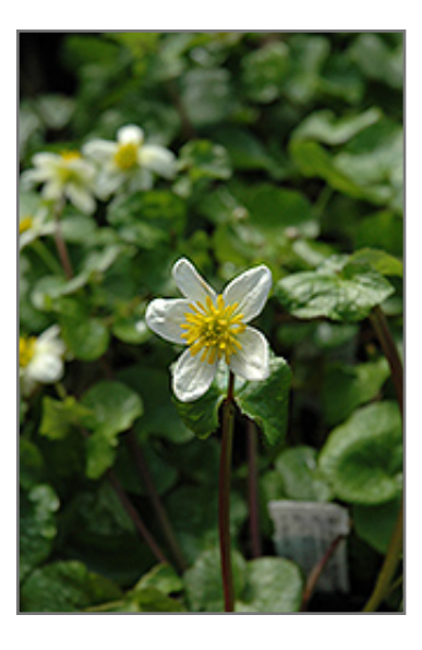
White Calamint flowers

Lovely creamy-white flowers emerge with yellow centers throughout summer; light green leaves are round, shiny, and fragrant; an excellent choice for borders and containers, tolerates moist soils