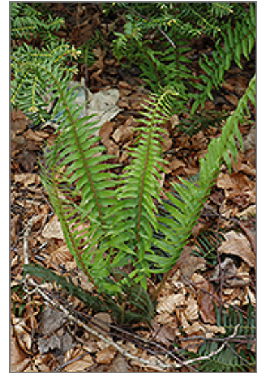
Deer Fern in spring

Deer Fern will grow to be about 20 inches tall at maturity, with a spread of 24 inches. Its foliage tends to remain dense right to the ground, not requiring facer plants in front. It grows at a medium rate, and under ideal conditions can be expected to live for approximately 10 years. As an evergreen perennial, this plant will typically keep its form and foliage year-round.