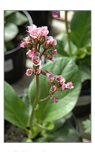
Red Beauty Bergenia flowers

Red Beauty Bergenia features unusual spikes of rose flowers with red eyes rising above the foliage from early to mid spring, which emerge from distinctive red flower buds. Its attractive large succulent oval leaves are forest green in colour. As an added bonus, the foliage turns a gorgeous dark red in the fall.