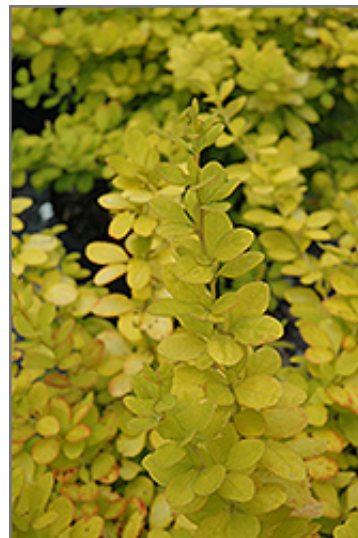
Golden Carousel Barberry foliage