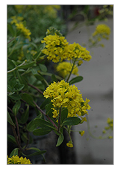
Mountain Gold Aurinia flowers

Mountain Gold Aurinia is covered in stunning clusters of fragrant yellow star-shaped flowers along the stems from mid spring to mid fall. Its small narrow leaves remain dark green in colour throughout the year.