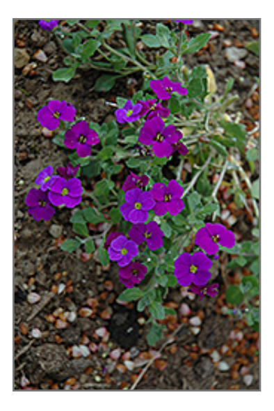
Royal Violet Rock Cress flowers