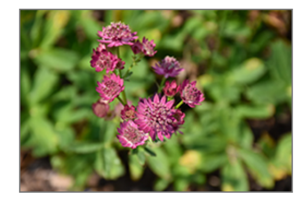
Venice Masterwort flowers