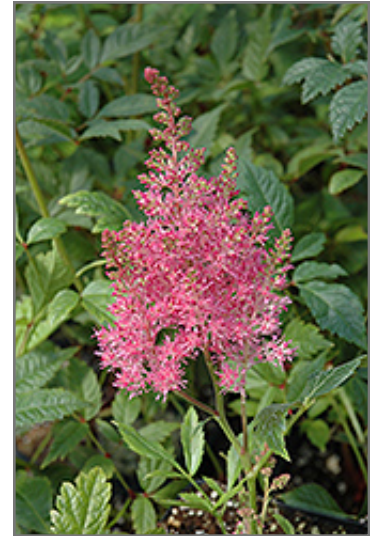
Astary Rose Astilbe flowers