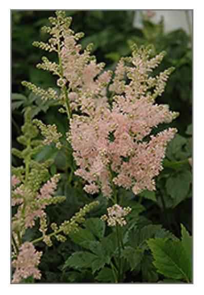
Apple Blossom Japanese Astilbe flowers

Lovely shell pink plumes, rising above glossy leaves; perfect in a shady spot with dappled light; prefers moisture so water regularly for abundant flowers and nice foliage