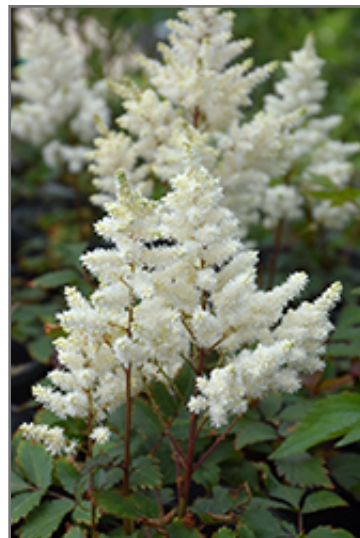
Younique White Astilbe flowers