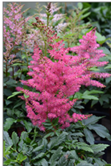
Younique Cerise Astilbe flowers