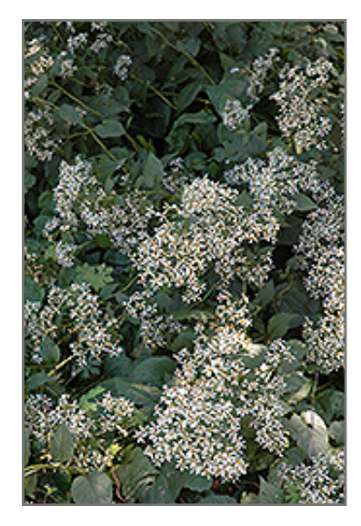
White Big Leaf Aster flowers

White Big Leaf Aster is recommended for the following landscape applications;