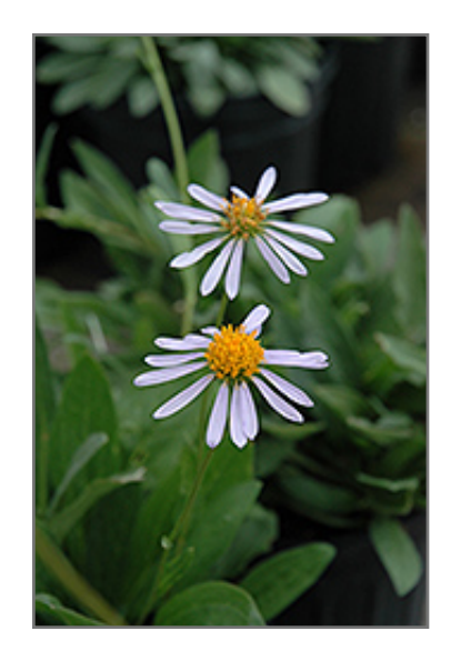
Wartburg Star Aster flowers

Profusion of lavender-blue flowers that mature to white, and attractive lance-like green leaves; prefers cool, moist soil; water the root zone instead of from the top to reduce fungal disease; water regularly to encourgage more blooms