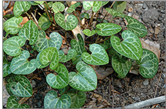
Woodlander's Select Alabama Wild Ginger foliage

Woodlander's Select Alabama Wild Ginger will grow to be only 6 inches tall at maturity, with a spread of 6 inches. Its foliage tends to remain low and dense right to the ground. It grows at a slow rate, and under ideal conditions can be expected to live for approximately 10 years. As an herbaceous perennial, this plant will usually die back to the crown each winter, and will regrow from the base each spring. Be careful not to disturb the crown in late winter when it may not be readily seen!